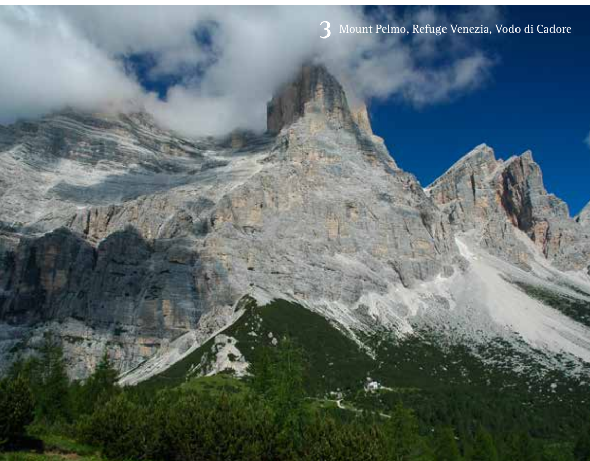
3 Mount Pelmo, Refuge Venezia, Vodo di Cadore

the most spectacular and famous mountain group: system n.1 M. Pelmo - Mondeval - Croda da Lago mountain group, and system n. 5: Dolomiti Settentrionali (northern Dolomites) the mountain group which also includes M. Antelao which dominates the Boite Valley from S. Vito to the Cadore Valley in the south and Sorapis and Croda Marcora that dominate the village of San Vito di Cadore in the north. Just one hour far from Venice, the Cadore area includes "Alto" (northern) and "Centro" (central) Cadore villages, each one with its particularity and marvels to discover: San Vito, Borca, Vodo, Valle, Cibiana, Pieve, Calalzo and Domegge di Cadore are linked together to give their guests a complete offer during summer and winter holidays.