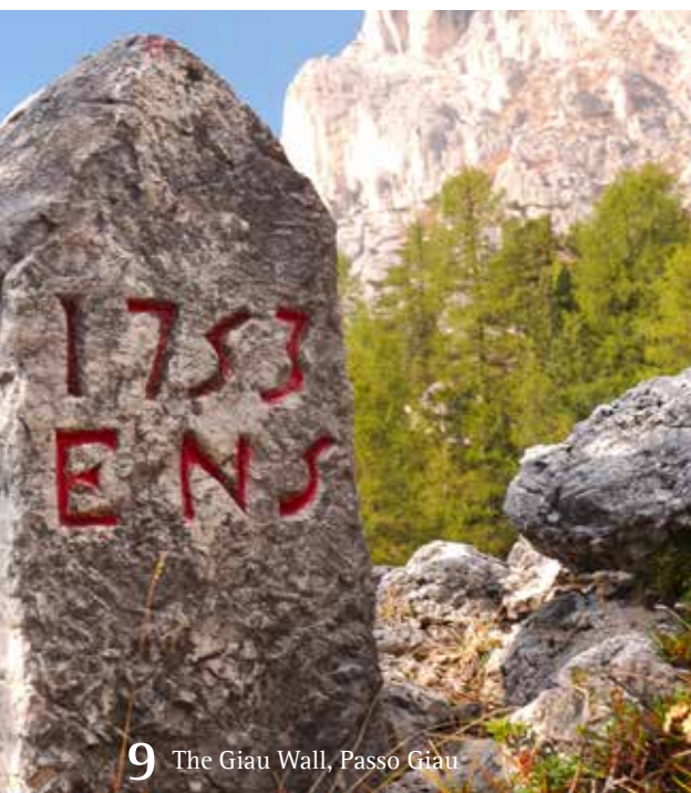
9 The Giau Wall, Passo Giau

The Natural Archeological springs, “Lagole” (Calalzo) where important finds have been brought to light dating back to the Palaeovenetian Age – and the spa area, delightful little springs which rise up straight out of the earth. The remains of the Wall of Giau (on the road from Pocol to Passo Giau, S.Vito di Cadore). This imposing wall dating back to the 18th century was built in San Vito by orders of the commissaries of the Republic of Venice and Hapsburg Empire to solve boundary controversies. The palaeontologic site of Pelmetto (Mount Pelmo) where it is possible to see the famous “dinosaur’s prints” probably left more than 230 million years ago. The archaeological site of Mondeval, between Mount Pelmo and the “Lastoi de Formin” where the burial site of a Mesolithic hunter was unearthed in 1985. The skeleton of the “Man of Mondeval”, who lived about 7,500 years ago, was found under a boulder with all his personal effects.