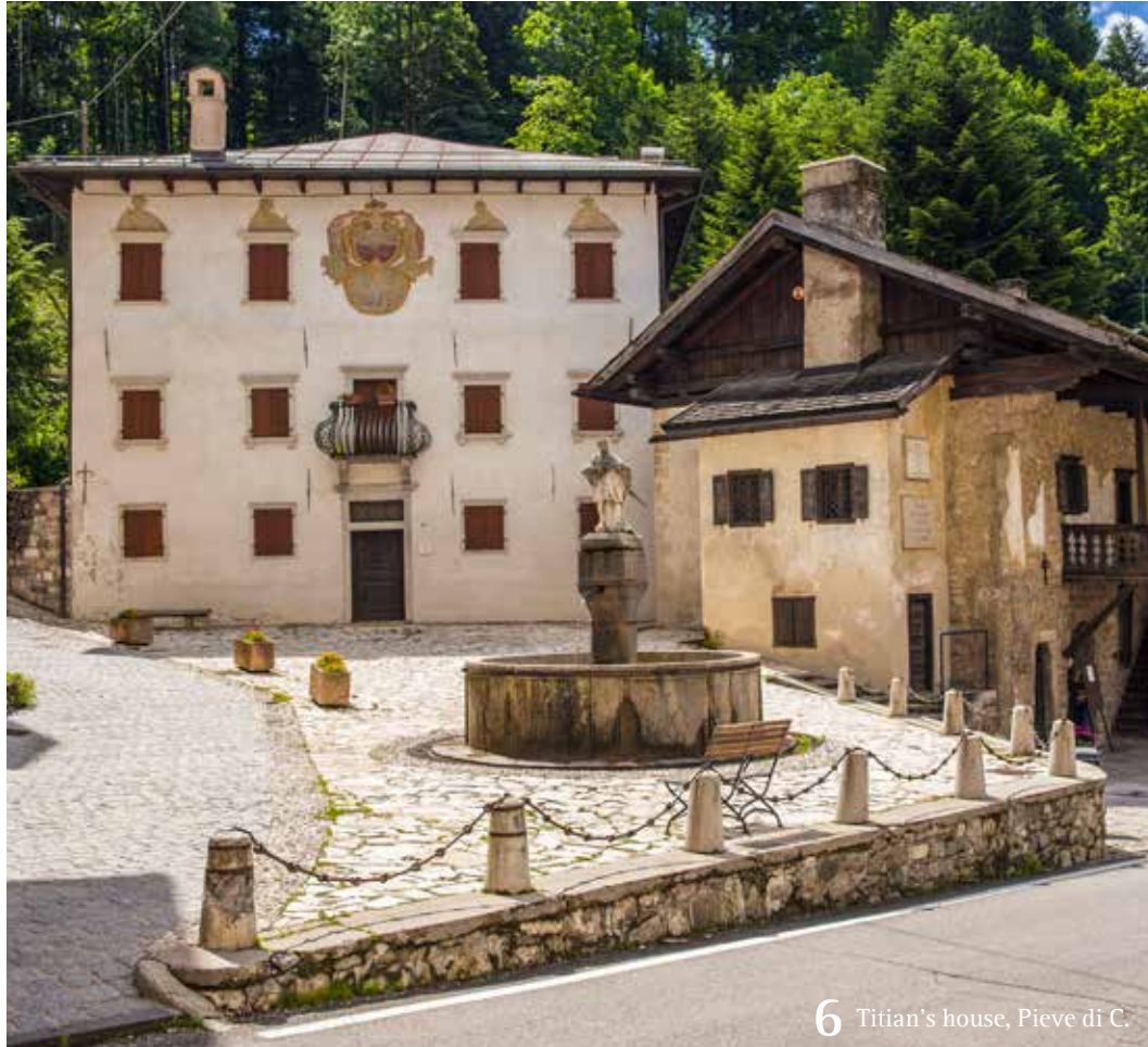
6 Titian's house, Pieve di C.

The Messner Mountain Museum Dolomites,(Monte Rite, Cibiana),The Wood Museum in Perarolo.