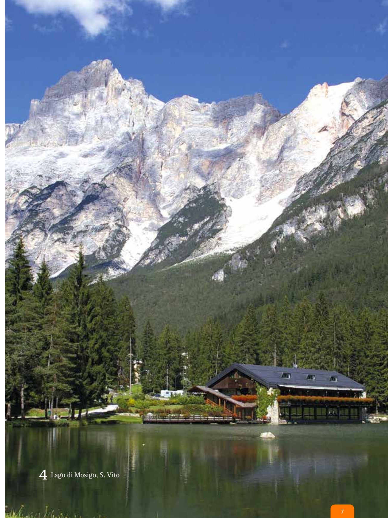
4 Lago di Mosigo, S. Vito