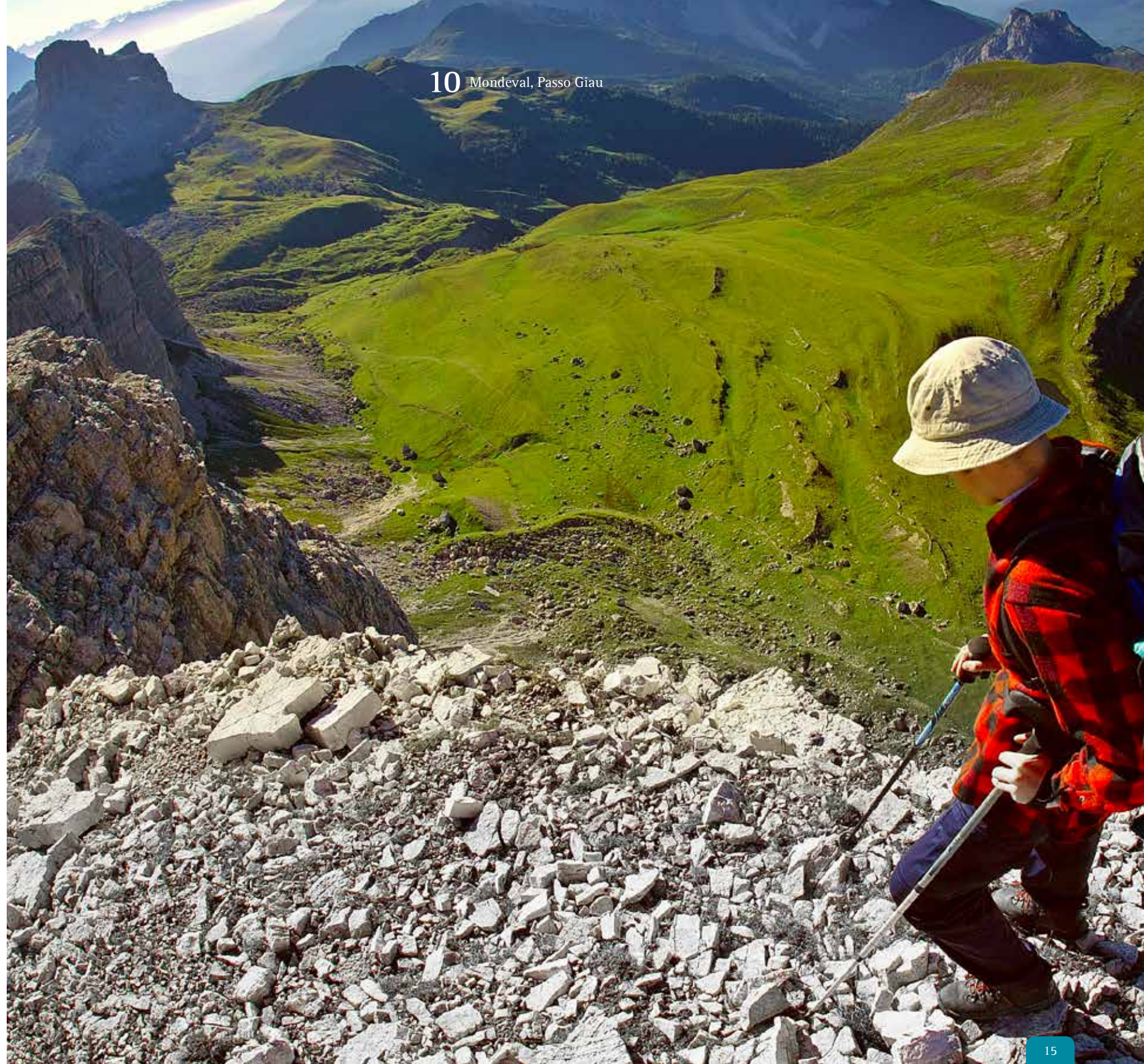
10 Mondeval, Passo Giau